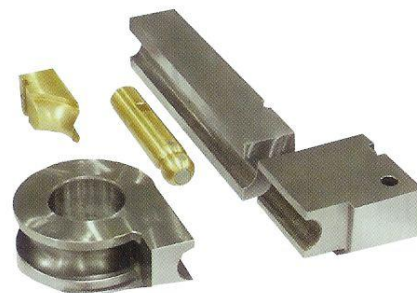
Stainless bending tools