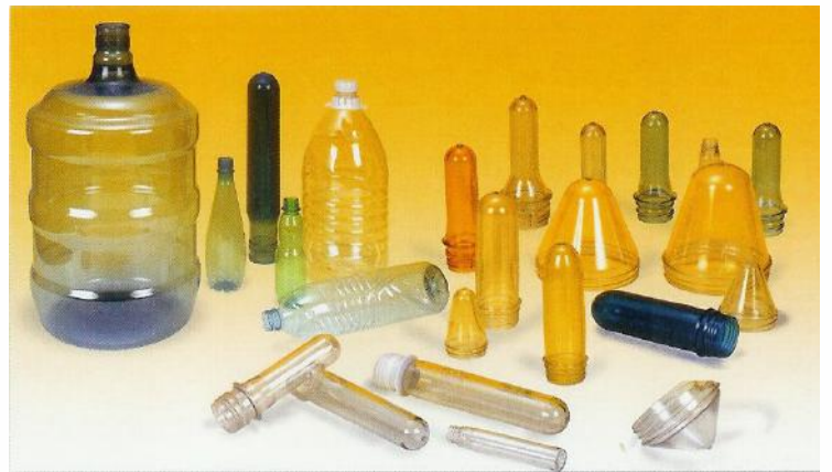
Plastic PET products produced by EN-400P