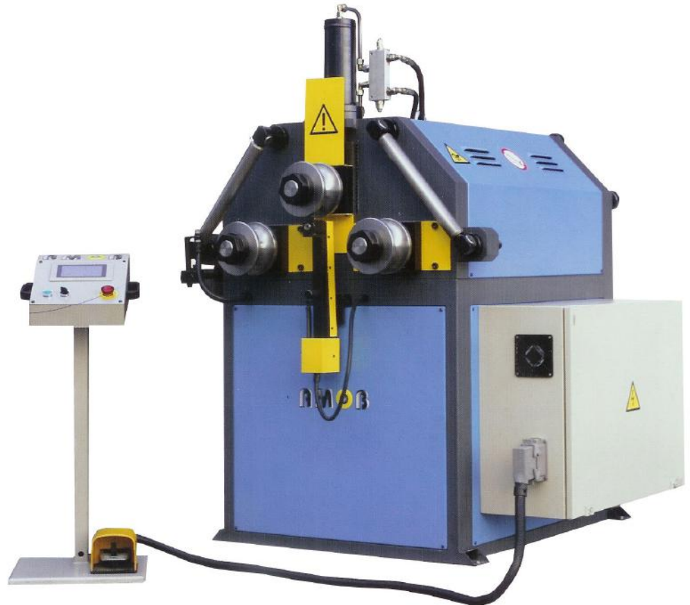
MAH 60/3 CNC