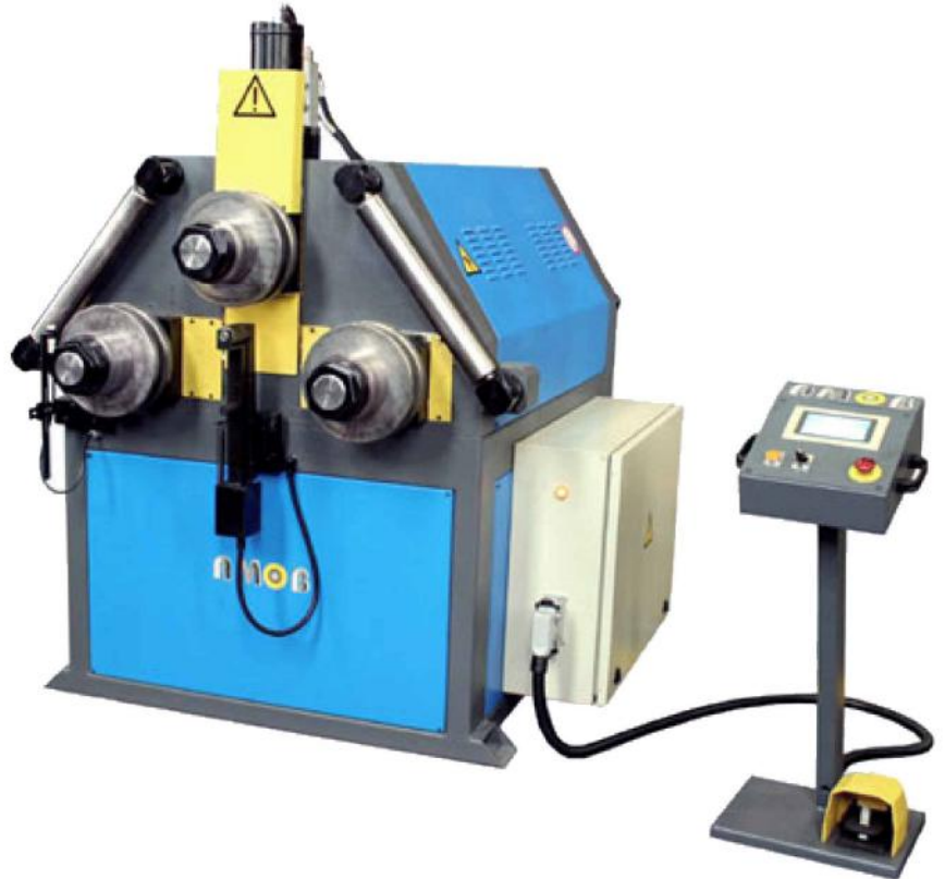
MAH 120/3 CNC